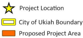
Fig 2-1 Regional Location