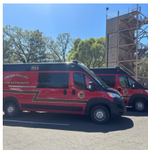
IFT Program: Strengthening Emergency Services Across the City