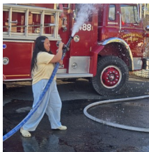
Ukiah Valley Fire Authority Open House