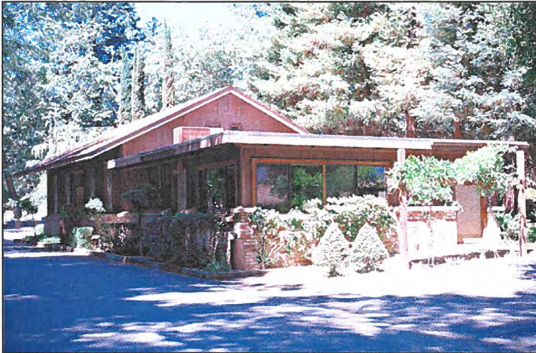
Office and chapel building, view to northwest.

Resource Name: Ukiah Cemetery Historic District