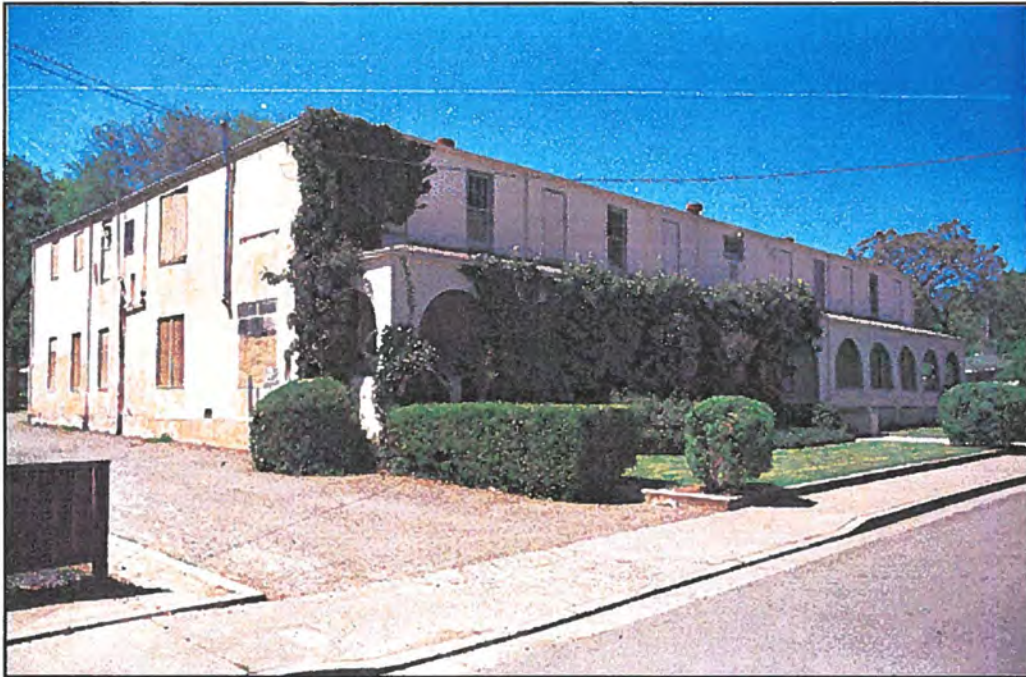
Girl's dormitory on west side of Barnes between Church and Stephenson, view to northwest. Top photo shows building as of May 1999, bottom photo shows building in July 1999, after porch had been removed. The building is a non-contributor to the district.

Resource Name: Albertinum School Historic District