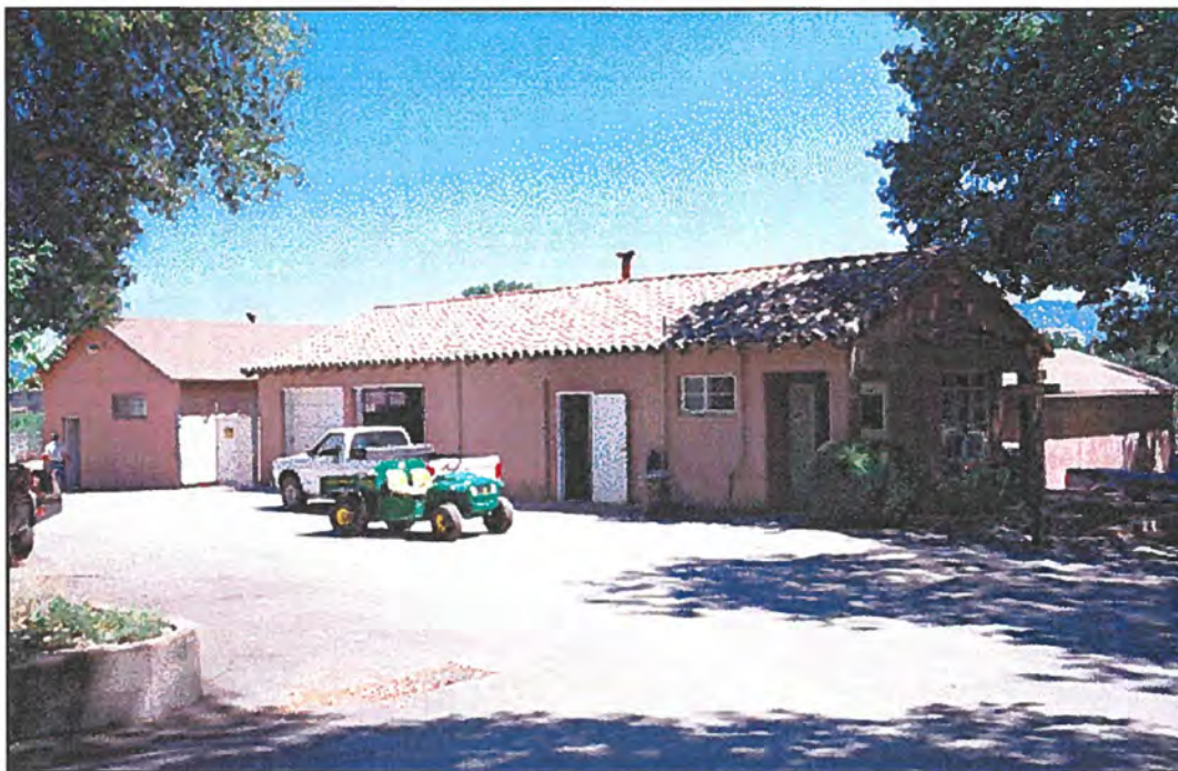
Service building complex, view to northeast.