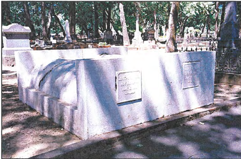
One of several pair of sarcophagi in the cemetery.

Resource Name: Ukiah Cemetery Historic District