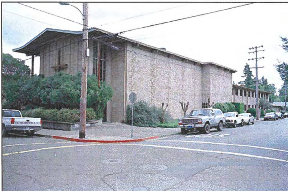
Chapel building, non-contributor, view to southeast.