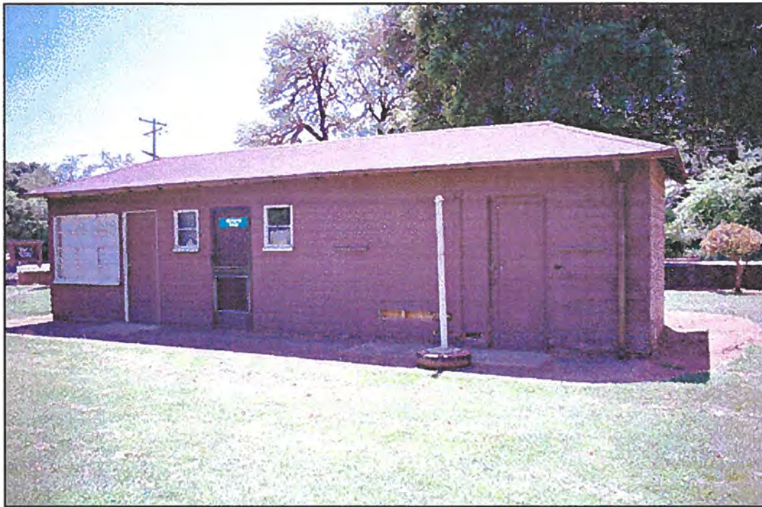
Service building, view to southwest.

Resource Name: Todd Grove Park Historic District