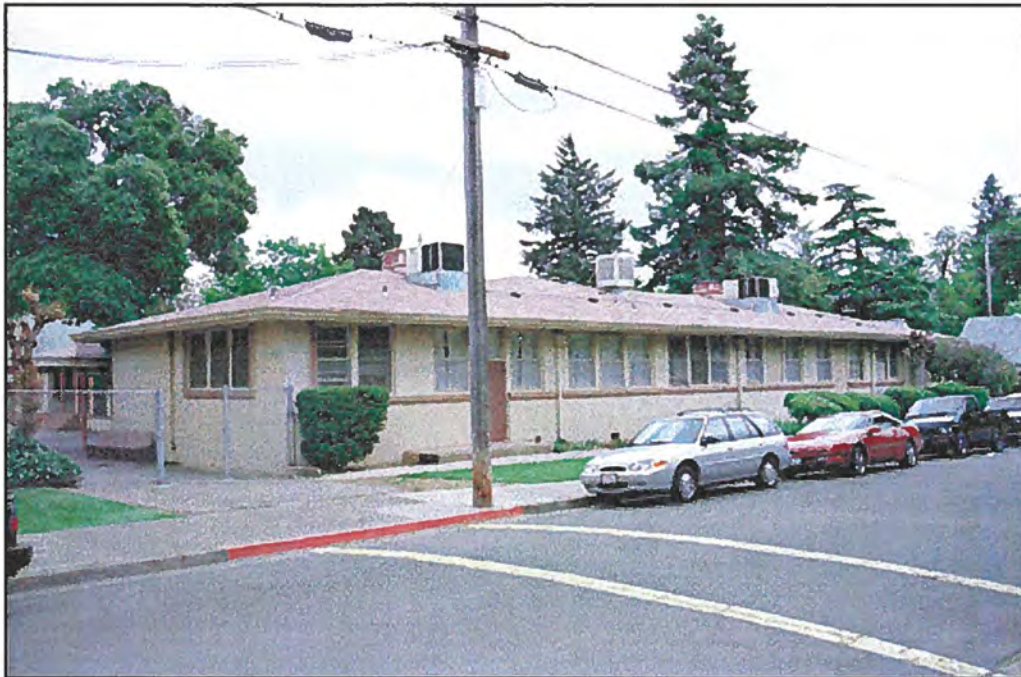
Building on east side of Barnes at Stephenson, view to southeast.

Resource Name: Albertinum School Historic District