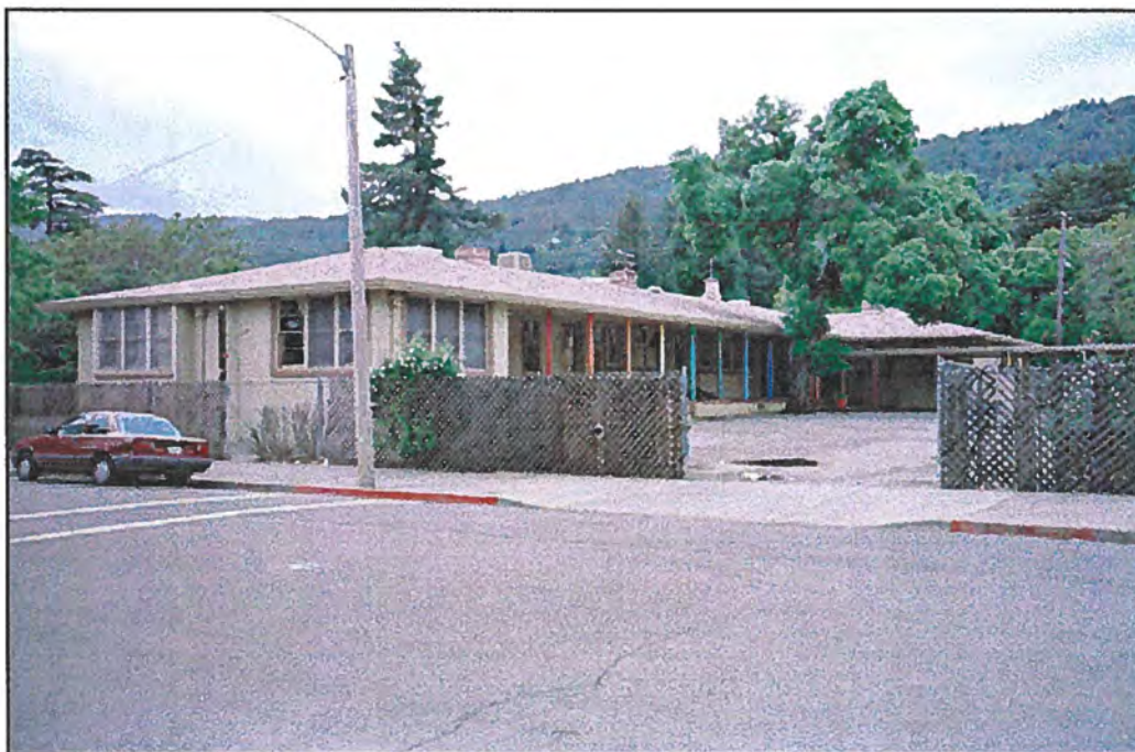
Building on west side of Hope (east side of Barnes) at Stephenson, view to southwest.