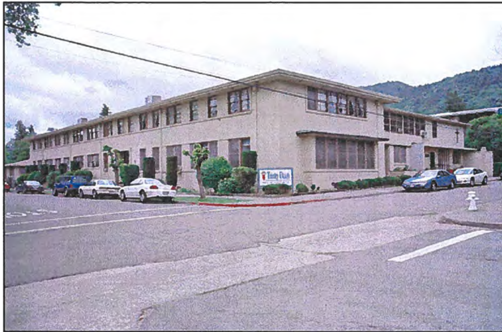
Dormitory building and reception (non-contributor) building (915 W. Church St.), view to southwest.

Resource Name: Albertinum School Historic District