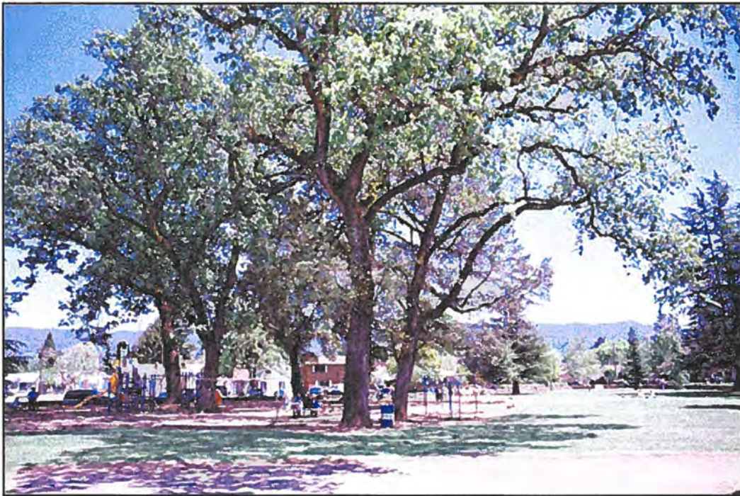
Overview of park showing oak grove, view to south.

Resource Name: Todd Grove Park Historic District