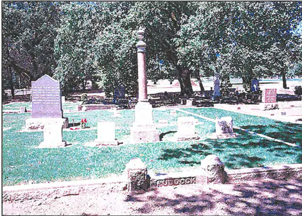
Cemetery plot surrounded by carved granite curb, view to west.

Resource Name: Ukiah Cemetery Historic District