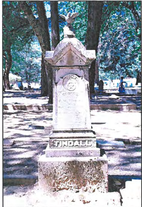
Typical early headstones