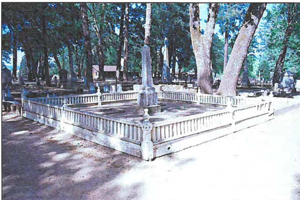
Ukiah Cemetery showing balustraded wooden fence, view to northeast.