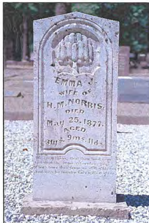
Headstone with willow symbolizing sorrow.