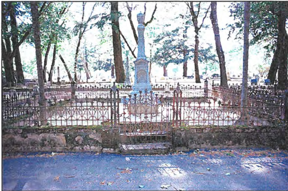
Ukiah Cemetery plots showing iron fences. Views to west.

Resource Name: Ukiah Cemetery Historic District