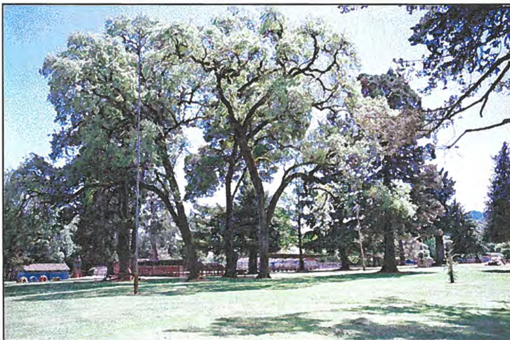
Overview showing landscaping and pool complex, view to southwest.