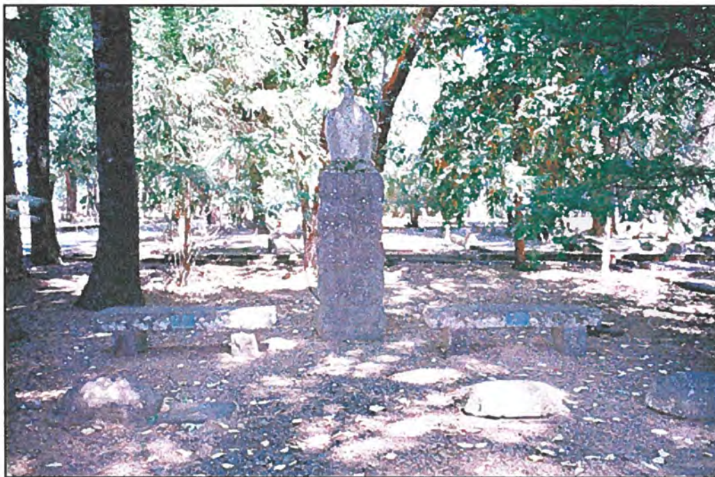
Grace Hudson (Sun House) plot showing naturalistic benches and monument, view to east.