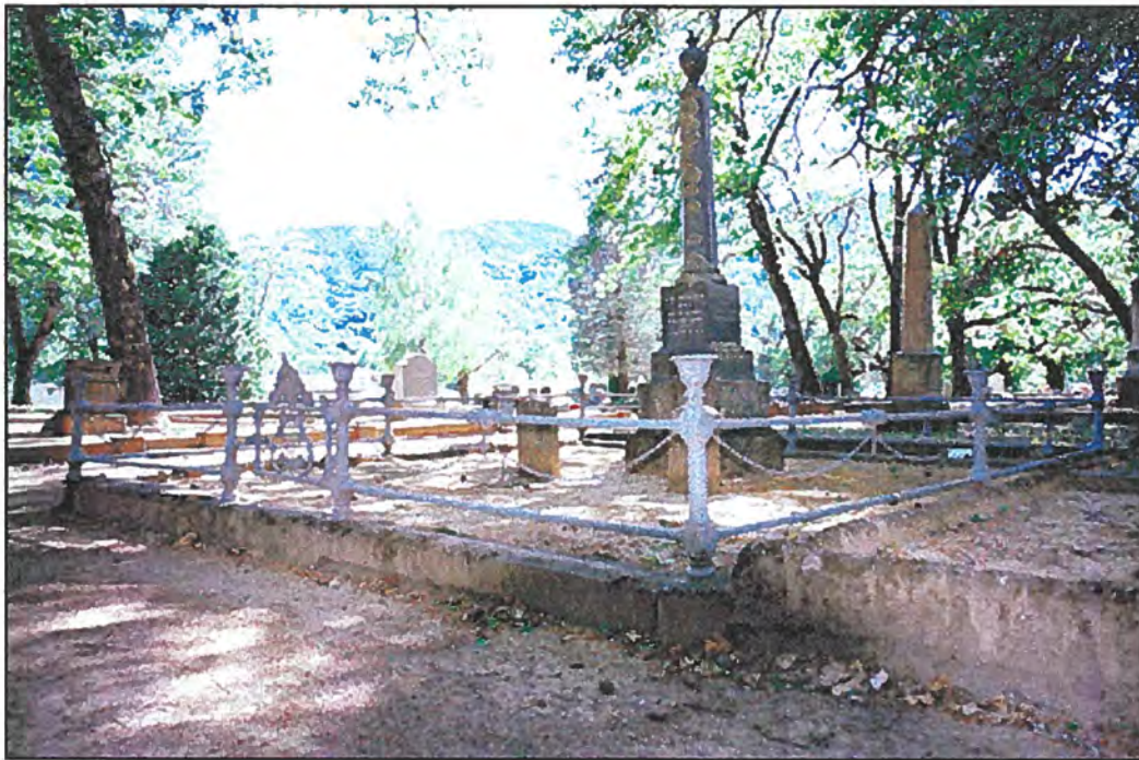
Ukiah Cemetery showing chain swag fence, view to southwest.

Resource Name: Ukiah Cemetery Historic District